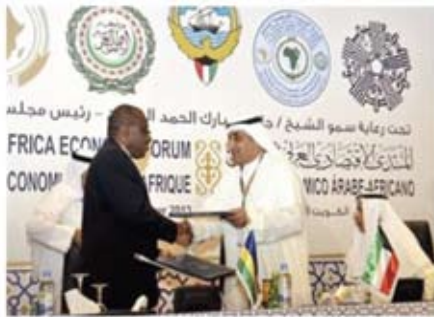
توقيع الصندوق الكويتي للتنمية الاقتصادية العربية اتفاقية مع جمهورية رواندا